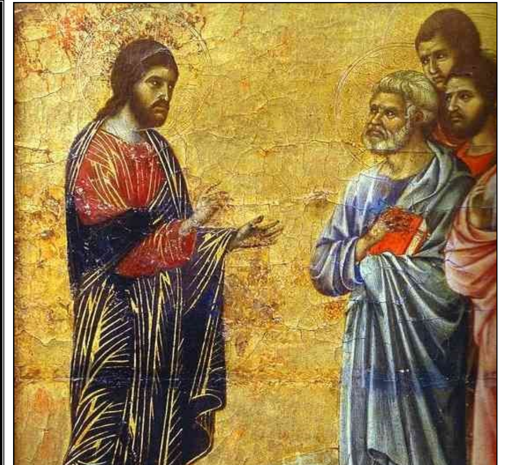
Maestà (detail of back crowning panel) Duccio di Buoninsegna, 1308-11

Through our Lord Jesus Christ, your Son, who lives and reigns with you in the unity of the Holy Spirit, one God, for ever and ever. Amen.