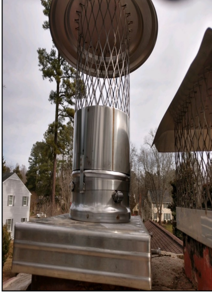
At the Rectory this week: Repairs to Rectory Chimney Oil Furnace Flue Liner & Cap