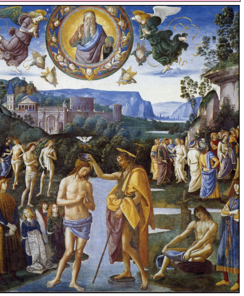
Baptism of Christ (Pietro Perugino), 1481-83

The Sacrament of Reconciliation is offered Saturdays at 5:00 PM and by appointment.