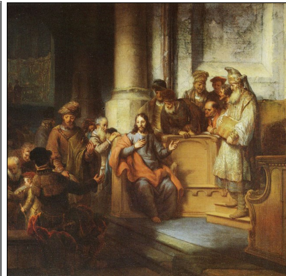
Christ Teaching in the Synagogue at Nazareth Gerbrand van den Eeckhout, 1658

Through our Lord Jesus Christ, your Son, who lives and reigns with you in the unity of the Holy Spirit, one God, for ever and ever. Amen.