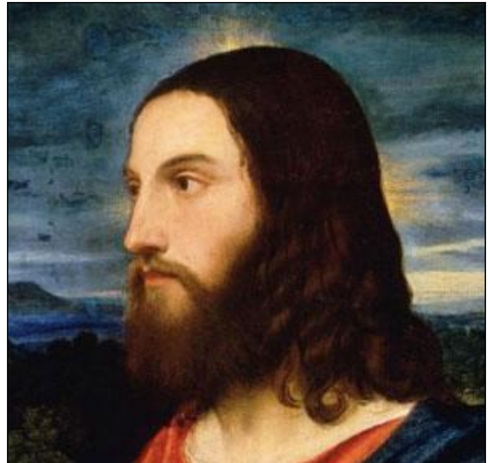
Christ the Redeemer Titian, 1533-1534

Almighty ever-living God, direct our actions according to your good pleasure, that in the name of your beloved Son we may abound in good works. Through our Lord Jesus Christ, your Son, who lives and reigns with you in the unity of the Holy Spirit, one God, for ever and ever. Amen.