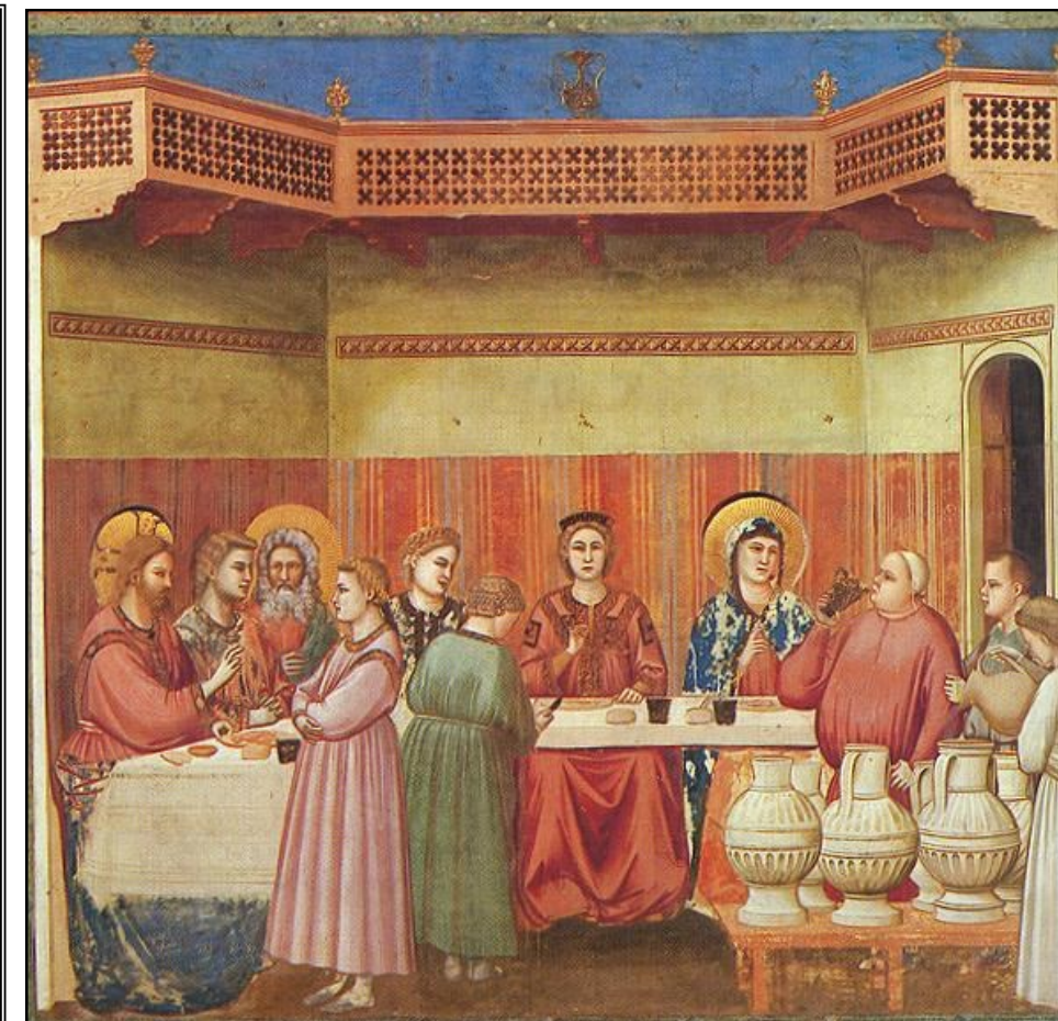
Marriage at Cana Giotto, 14th Century

Through our Lord Jesus Christ, your Son, who lives and reigns with you in the unity of the Holy Spirit, one God, for ever and ever. Amen.