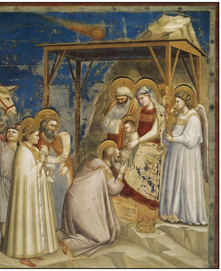
Adoration of the Magi, 1304-06 Giotto di Bondon

2631 Pocahontas Trail, P.O. Box 648, Quinton, VA 23141 OFFICE: 804-932-4125 FAX: 804-932-8126 RECTORY: 804-557-3962 Email: secretary@seascatholicchurch.org Website: www.seascatholicchurch.org Facebook: facebook.com/SEASCatholic Office Hours: M-F 9:00 AM-2:30 PM