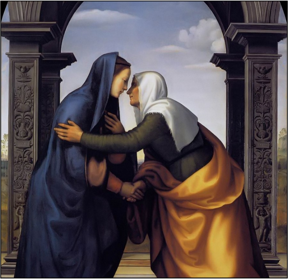
The Visitation, 1503 (Mariotto Albertinelli)

P our forth, we beseech you, O Lord, your grace into our hearts, that we, to whom the Incarnation of Christ your Son was made known by the message of an Angel, may by his Passion and Cross be brought to the glory of his Resurrection. Who lives and reigns with you in the unity of the Holy Spirit, one God, for ever and ever. Amen.