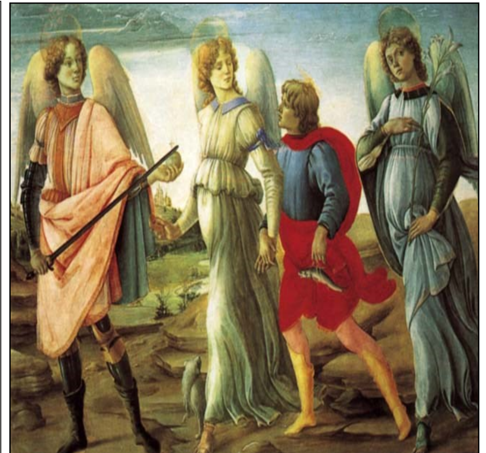
The Three Archangels and Tobias, Filippino Lippi, 1485

O God, who manifest your almighty power above all by pardoning and showing mercy, bestow, we pray, your grace abundantly upon us and make those hastening to attain your promises heirs to the treasures of heaven. Through our Lord Jesus Christ, your Son, who lives and reigns with you in the unity of the Holy Spirit, one God, for ever and ever. Amen.