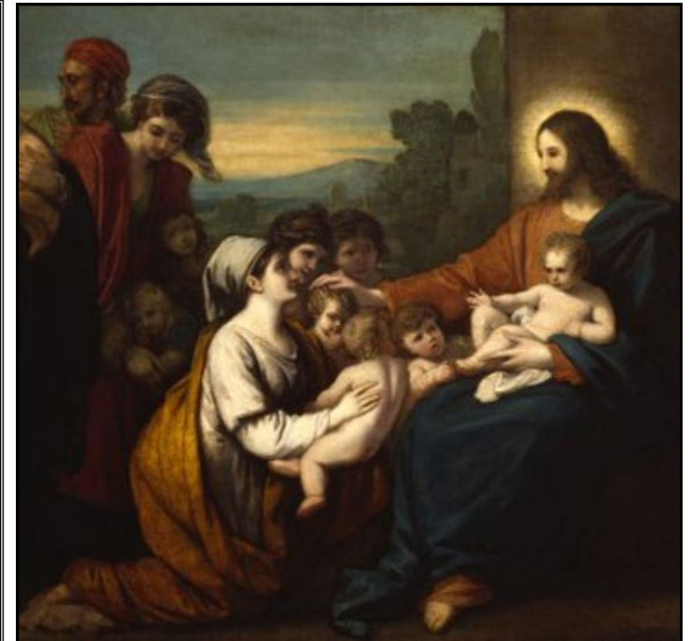
Christ Blessing Little Children, Benjamin West, 1781

Through our Lord Jesus Christ, your Son, who lives and reigns with you in the unity of the Holy Spirit, one God, for ever and ever. Amen.