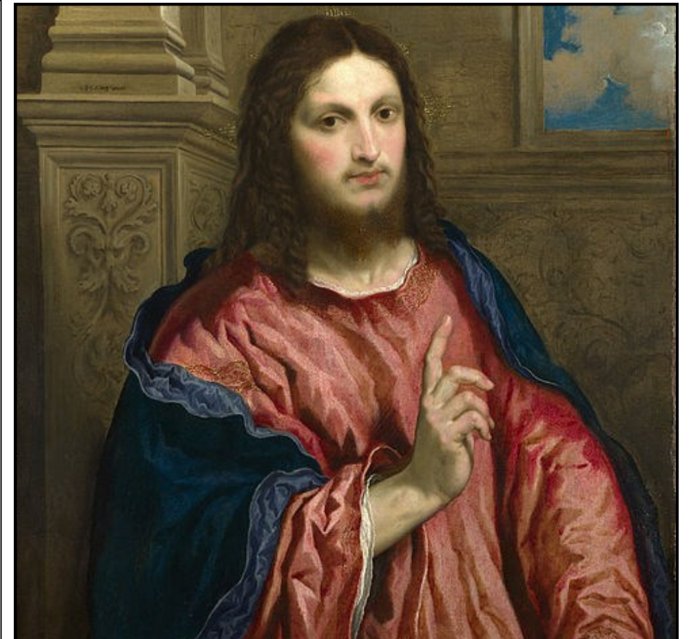
Christ as 'The Light of the World' (Paris Bordone), The National Gallery, London, about 1550

Through our Lord Jesus Christ, your Son, who lives and reigns with you in the unity of the Holy Spirit, one God, for ever and ever. Amen.