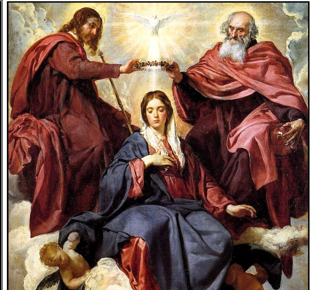
The Coronation of the Virgin, Diego Velázquez, 1641-1644

Through our Lord Jesus Christ, your Son, who lives and reigns with you in the unity of the Holy Spirit, one God, for ever and ever. Amen.