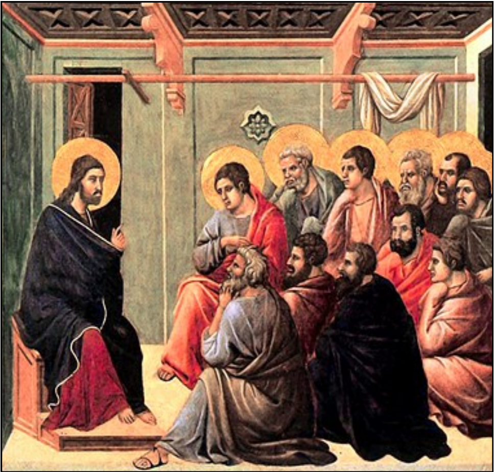
Stories of the Passion, Maestà Altarpiece, Duccio di Buoninsegna, 1308-11

Through our Lord Jesus Christ, your Son, who lives and reigns with you in the unity of the Holy Spirit, one God, for ever and ever. Amen.