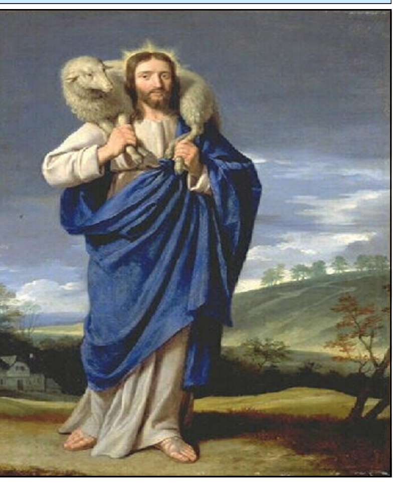
The Good Shepherd (Philippe de Champaigne), 17th Century