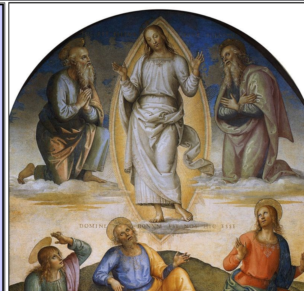
The Transfiguration of Christ (fresco), Pietro Perugino (Collegio del Cambio, Perugia, Italy), 1497-1500

Through our Lord Jesus Christ, your Son, who lives and reigns with you in the unity of the Holy Spirit, one God, for ever and ever. Amen.