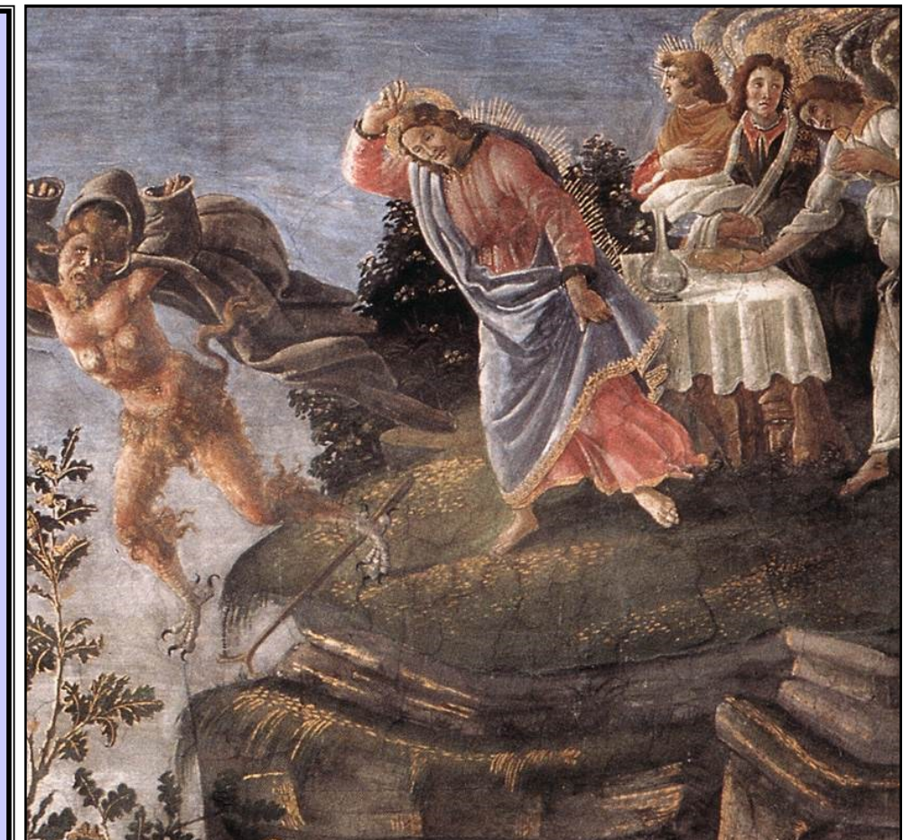
The Temptation of Christ (fresco, detail 6), Sandro Botticelli, Sistine Chapel, 1445-1510

Grant, almighty God, through the yearly observances of holy Lent, that we may grow in understanding of the riches hidden in Christ and by worthy conduct pursue their effects. Through our Lord Jesus Christ, your Son, who lives and reigns with you in the unity of the Holy Spirit, one God, for ever and ever. Amen.