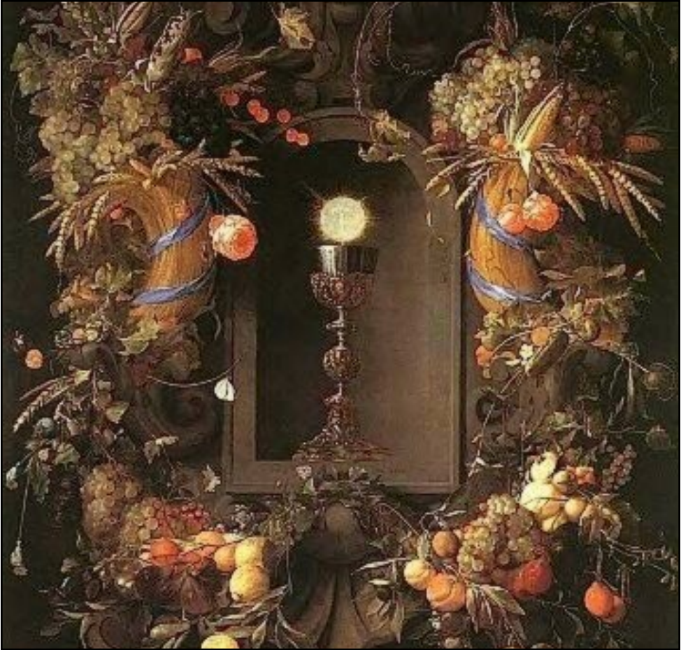
Communion Cup (Jan Davidsz de Heem), 1648