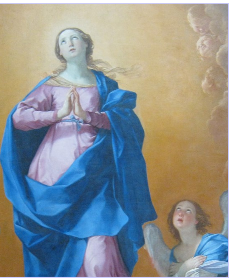
The Immaculate Conception Guido Reni (The Metropolitan Museum of Art), 1627