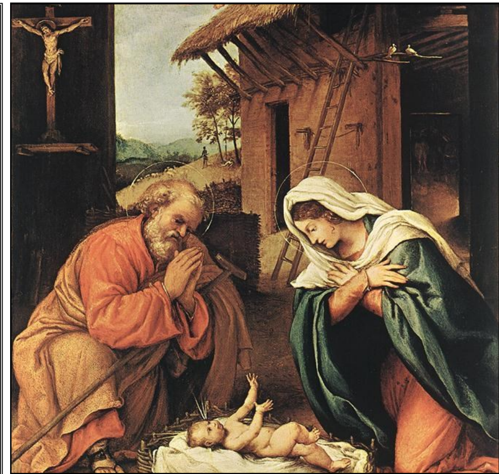
The Nativity of Christ (Lorenzo Lotto), 1523

O God, who were pleased to give us the shining example of the Holy Family, graciously grant that we may imitate them in practicing the virtues of family life and in the bonds of charity, and so, in the joy of your house, delight one day in eternal rewards. Through our Lord Jesus Christ, your Son, who lives and reigns with you in the unity of the Holy Spirit, one God, for ever and ever. Amen.