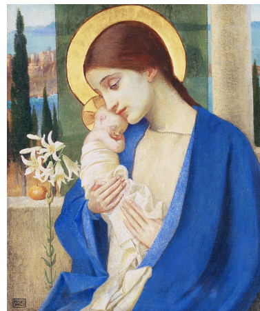
Madonna and Child Marianne Stokes (1905)