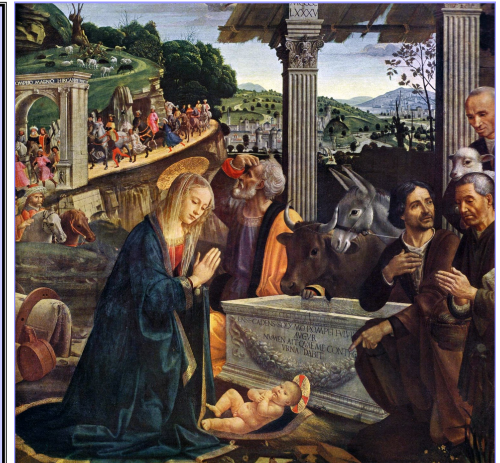
Adoration of the Shepherds (Domenico Ghirlandaio), 1485

Who lives and reigns with you in the unity of the Holy Spirit, one God, for ever and ever. Amen.