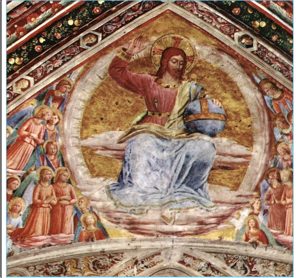
Christ the Judge Fra Angelico, 1447

Almighty and merciful God, graciously keep from us all adversity, so that, unhindered in mind and body alike, we may pursue in freedom of heart the things that are yours. Through our Lord Jesus Christ, who lives and reigns with you in the unity of the Holy Spirit, one God, for ever and ever. Amen.