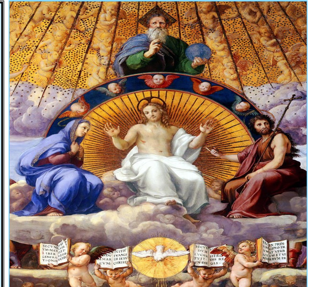
“La Disputa” - Stanze di Raffaello, Apostolic Palace, Vatican Raphael (detail from fresco), 1510-11

Through our Lord Jesus Christ, who lives and reigns with you in the unity of the Holy Spirit, one God, for ever and ever. Amen.