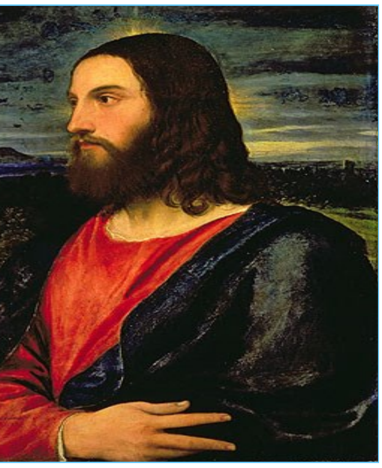
Christ the Redeemer Tiziano Vecellio (Titian), 1532-34

Facebook: facebook.com/SEASCatholic Twitter: twitter.com/SEASQuinton Office Hours: M-F 9:00 AM-2:30 PM WEEKEND MASS SCHEDULE: Saturday Vigil-5:30 PM Sunday—8:30 AM & 11:00 AM The Sacrament of Reconciliation is offered Saturdays at 5:00 PM and by appointment.