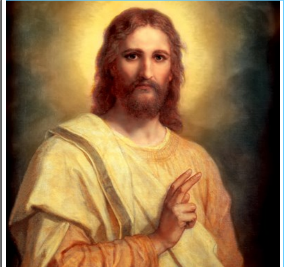
Christ's Image, Heinrich Hofmann, 1894

Almighty ever-living God, increase our faith, hope and charity, and make us love what you command, so that we may merit what you promise. Through our Lord Jesus Christ, who lives and reigns with you in the unity of the Holy Spirit, one God, for ever and ever. Amen.