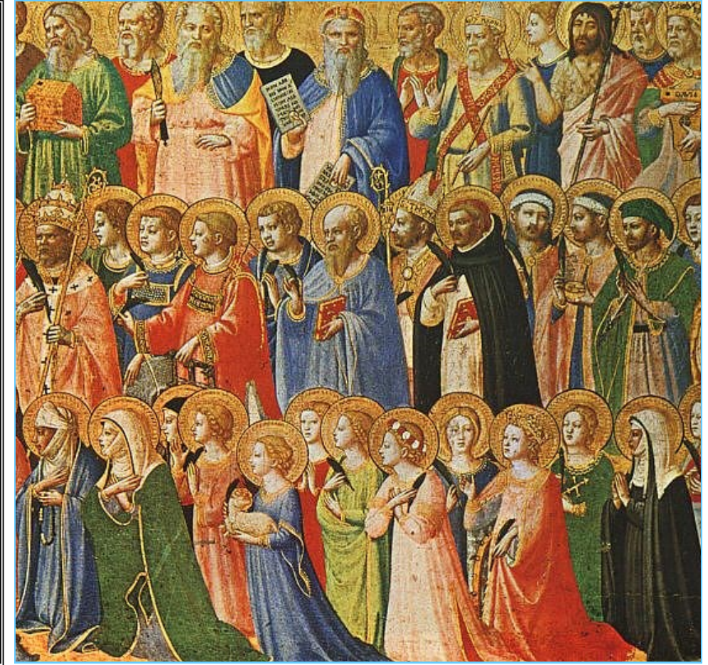
The Forerunners of Christ with Saints and Martyrs (Tempera on wood, Fiesole San Domenico Altarpiece) Fra Angelico, 1423-24

Almighty ever-living God, by whose gift we venerate in one celebration the merits of all the Saints, bestow on us, we pray, through the prayers of so many intercessors, an abundance of the reconciliation with you for which we earnestly long. Through our Lord Jesus Christ, who lives and reigns with you in the unity of the Holy Spirit, one God, for ever and ever. Amen.