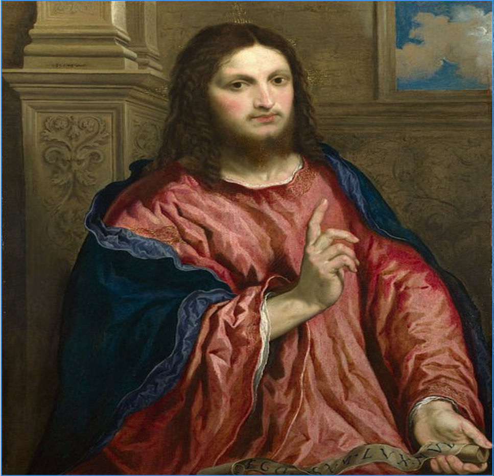
Christ as ‘The Light of the World’ (The National Gallery, London), Paris Bordone , abt 1550

Through our Lord Jesus Christ, who lives and reigns with you in the unity of the Holy Spirit, one God, for ever and ever. Amen.