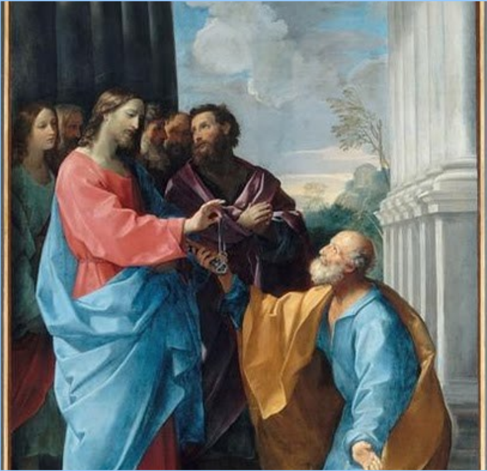
Christ Giving the Keys to St. Peter (Musée du Louvre, Paris), Guido Reni, 1624-26

Through our Lord Jesus Christ, who lives and reigns with you in the unity of the Holy Spirit, one God, for ever and ever. Amen.