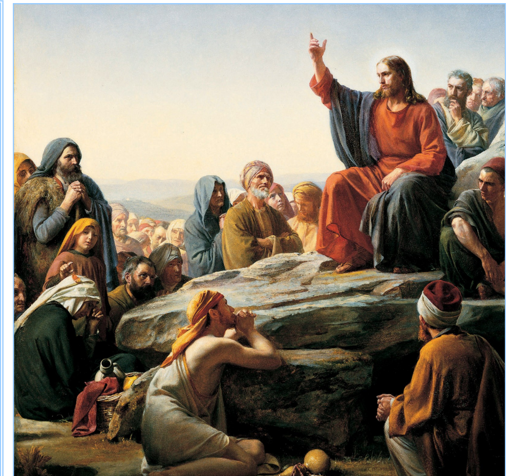
Sermon on the Mount, Carl Heinrich Bloch, 1834-1890

Through our Lord Jesus Christ, who lives and reigns with you in the unity of the Holy Spirit, one God, for ever and ever. Amen.