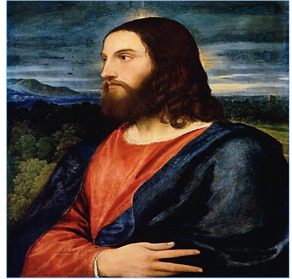
Christ the Redeemer, Tiziano Vecellio (Titian), 1532-34

Through our Lord Jesus Christ, who lives and reigns with you in the unity of the Holy Spirit, one God, for ever and ever. Amen.