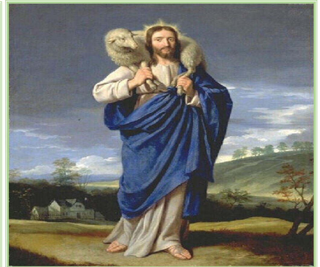
The Good Shepherd Philippe de Champaigne, 17th Century

Who lives and reigns with you in the unity of the Holy Spirit, one God, for ever and ever. Amen.