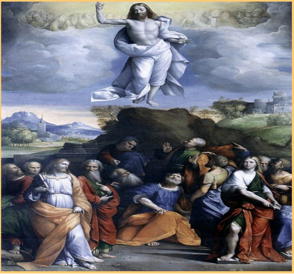
The Ascension of Christ Benvenuto Tisio da Garofalo, 1510-1520

Gladden us with holy joys, almighty God, and make us rejoice with devout thanksgiving, for the Ascension of Christ your Son is our exaltation, and, where the Head has gone before in glory, the Body is called to follow in hope. Through our Lord Jesus Christ, who lives and reigns with you in the unity of the Holy Spirit, one God, for ever and ever. Amen.