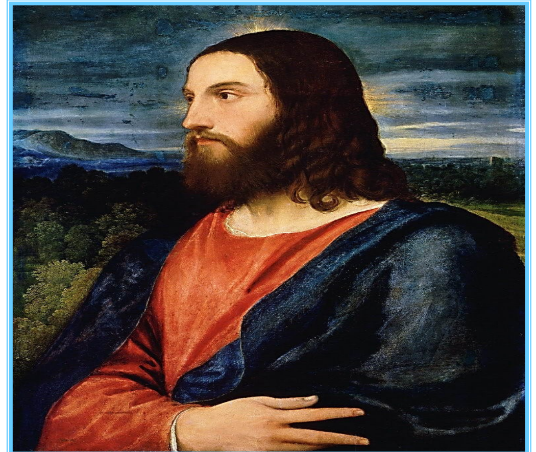
Christ the Redeemer Tiziano Vecellio (Titian), 1532-1534

Through our Lord Jesus Christ, who lives and reigns with you in the unity of the Holy Spirit, one God, for ever and ever. Amen.