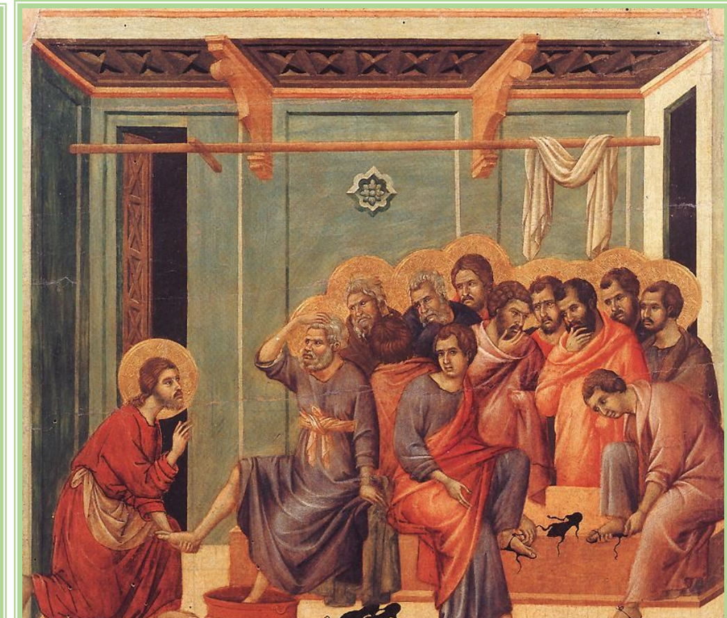
Christ Washing the Disciples' Feet Duccio di Buoninsegna, 1308-1311

Through our Lord Jesus Christ, who lives and reigns with you in the unity of the Holy Spirit, one God, for ever and ever. Amen.