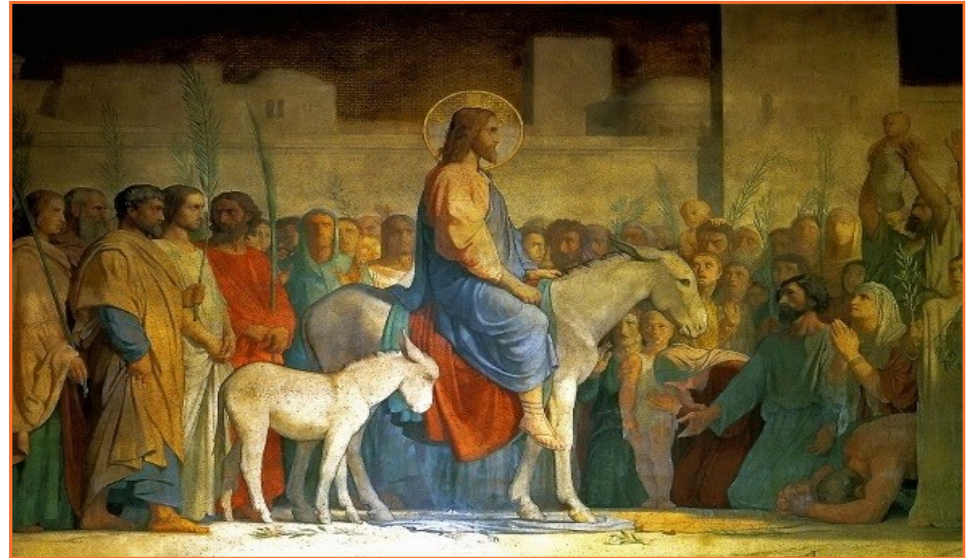
Entry into Jerusalem Hippolyte Flandrin, 1842