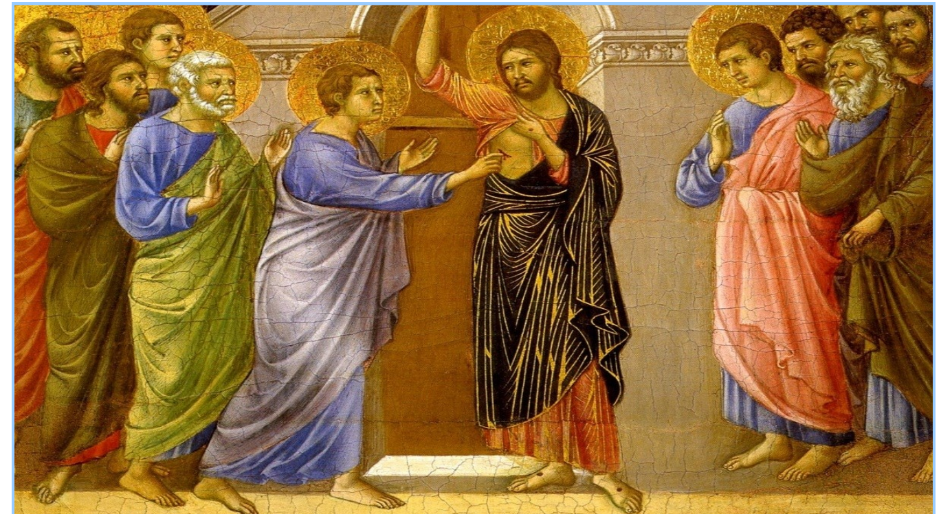
The Incredulity of St. Thomas (Maestà Altarpiece) Duccio di Buoninsegna (1308-1311)