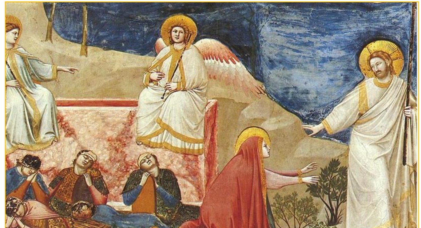
The Resurrection (Cappella degli Scrovegni all’ Arena, Padua, Italy) Giotto di Bondone (1304-1306)