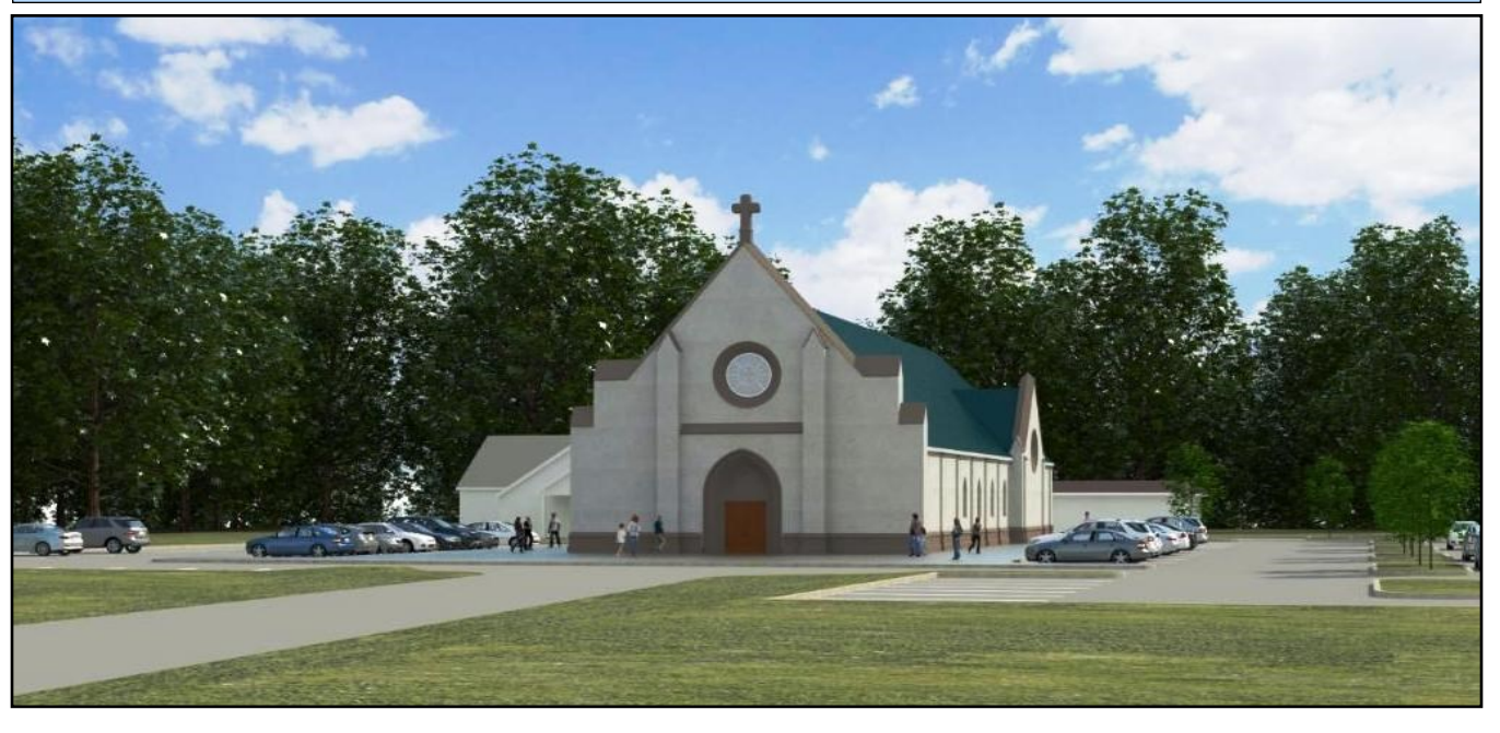
SEAS New Church Exterior