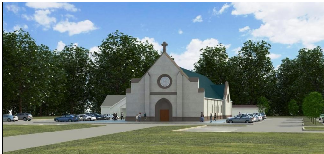
SEAS New Church Exterior

The Fifth Sunday in Ordinary Time February 9, 2020