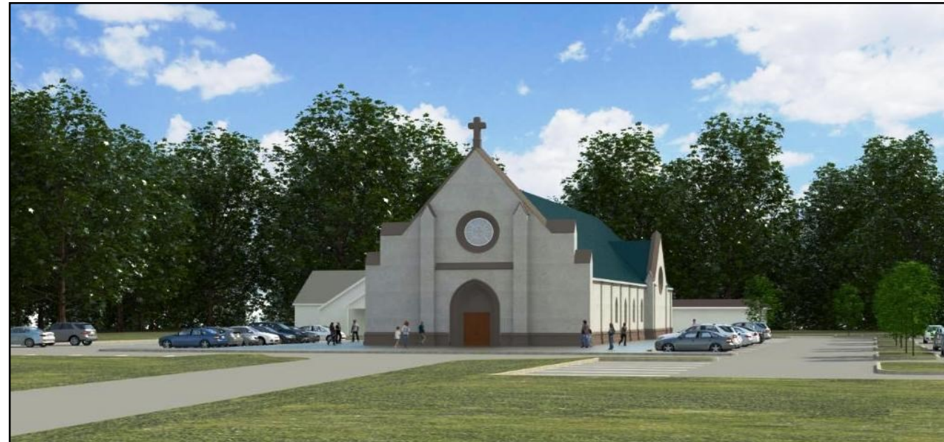
SEAS New Church Exterior