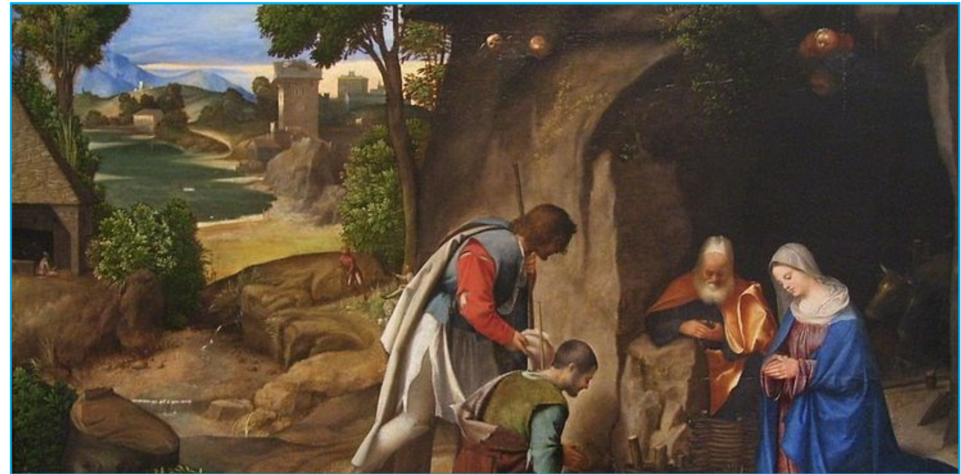
The Adoration of the Shepherds Giorgione, 1505