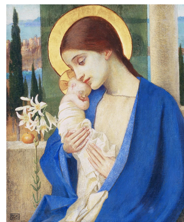
Madonna and Child Marianne Stokes (1905)